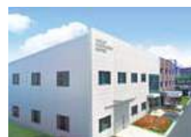
KORLOY Engineering Center