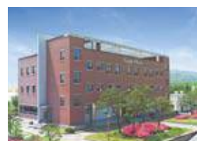
Jincheon Factory Office