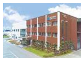
Cheongju Research & Development