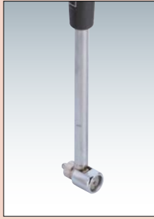
35-60 mm / 1.4-2.5"