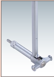
100-160 mm / 4.0-6.5"