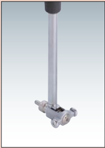
50-150 mm / 2.0-6.0"