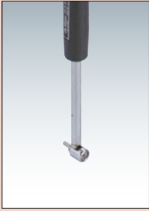
18-35 mm / .7-1.4"