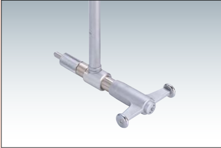
160-250 mm / 6.5-10.0"