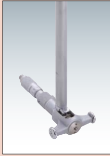
100-160 mm / 4-6.4"