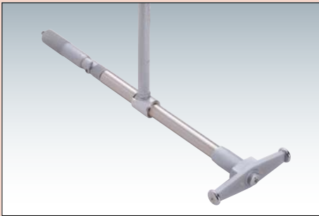
400-600 mm / 16-24"