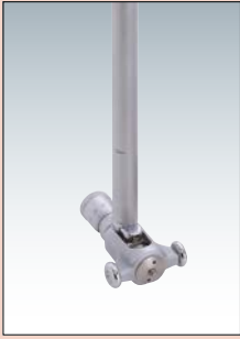
60-100 mm / 2.4-4"