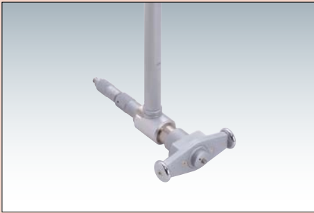
150-250 mm / 6-10"