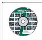
software CD (included)