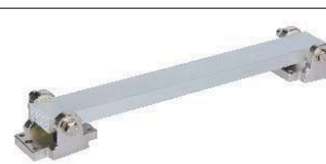
mounting bracket (included)