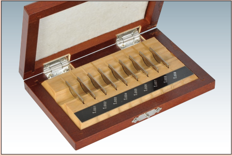
Steel 9-block set