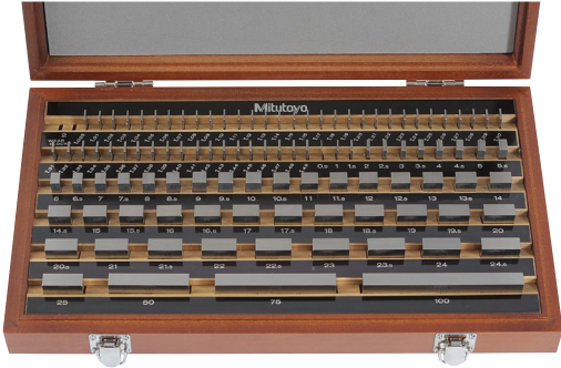
Steel 103-block set