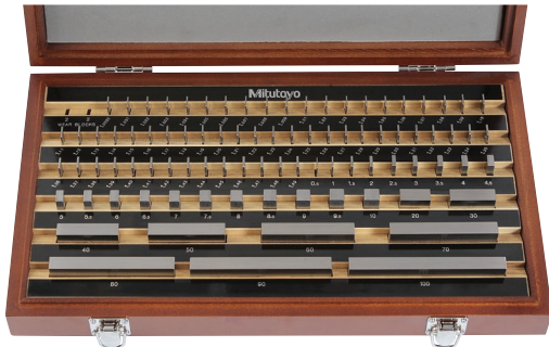
Steel 88-block set