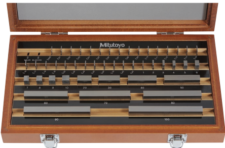
Steel 47-block set