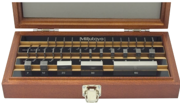
Steel 32-block set