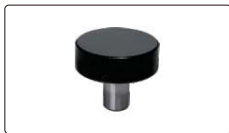
Ø60mm flat anvil (included)