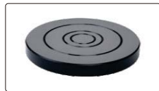
Ø150mm flat anvil (included)