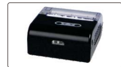
wireless printer (optional)