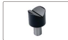
V-type anvil (included)