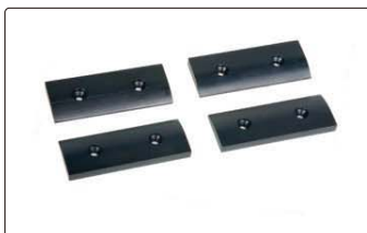
supports for cylinder or tube workpieces (included)