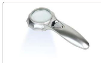
magnifier with LED (included)