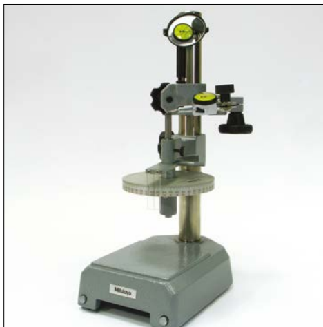
Calibrating a lever indicator.