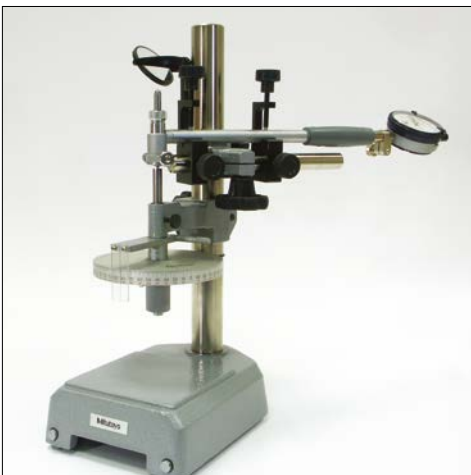
Calibrating a bore gauge.