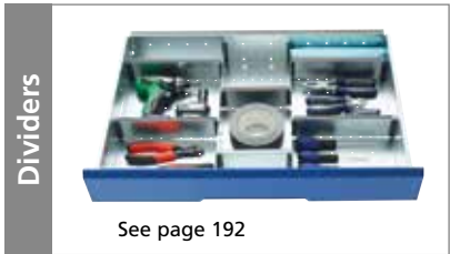
See page 192