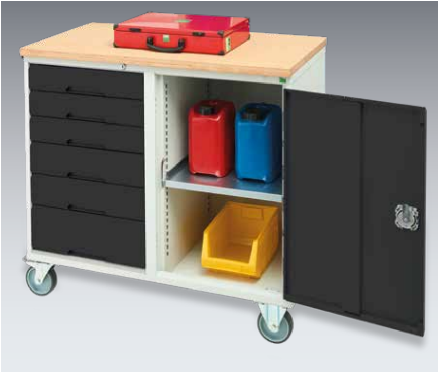
bott verso is also available with RAL7035 light grey, RAL3004 red, or RAL7016 anthracite (shown) fronts / doors.